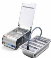
Optional tube for external air extraction