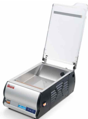
Sirman Vacuum Packaging Machines , model Easyvac 25 :

Sirman Spa Viale dell'Industria 9/11 35010 PIEVE DI CURTAROLO (PD), Italy Tel./Fax. +39 049 9698666 / +39 049 9698688 email: info@sirman.com