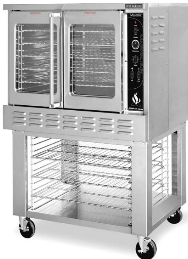
M-I-GG Shown with optional glass door and casters