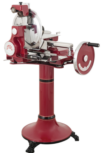
An elegant, strong base made especially for flywheel slicer is available.